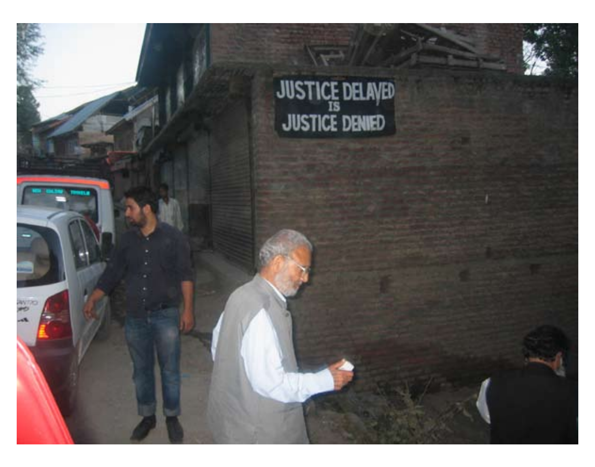
CRPF camp overlooking the Rambiara nallah where bodies were found and murder site