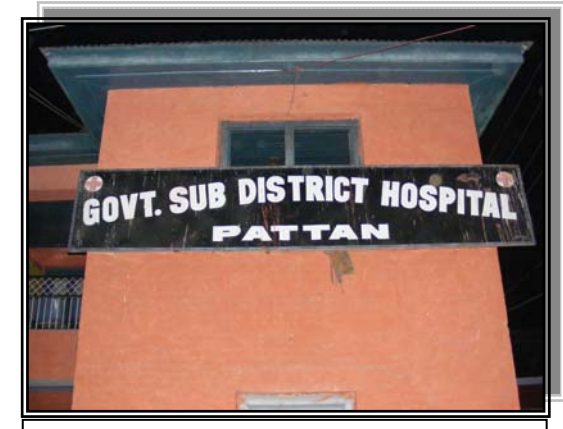
The main block of Pattan hospital

The more senior among the two surgeons on duty then, judged the risks of not responding to the demands of the armed intruders greater than actually opening the door. He was then attending to between ten and twelve patients on an urgent basis, besides which the casualty ward was packed with the numerous volunteers that had brought in the patients, in the absence of adequate ambulance and stretcher services. His recollection is that there were then about five volunteers within the ward for every patient. A possible panic by the assembled crowd within the casualty ward could potentially have proved fatal for the seriously injured patients under his care.